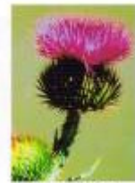
Scotch Thistle ( Oxypropion acanthium )