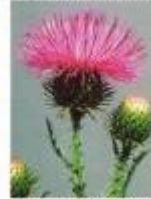
Plumeless Thistle ( Cirsium acanthoides )