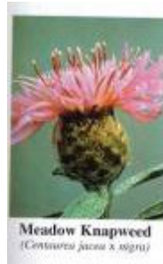
Meadow Knapweed ( Centaurea jacea x nigra )

This website has a lot of information on identification and application of products.